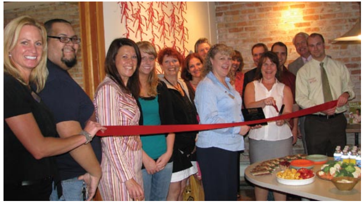
thriveOn Creative celebrates its new location at 400 DeWitt-Seitz Marketplace building in Canal Park.