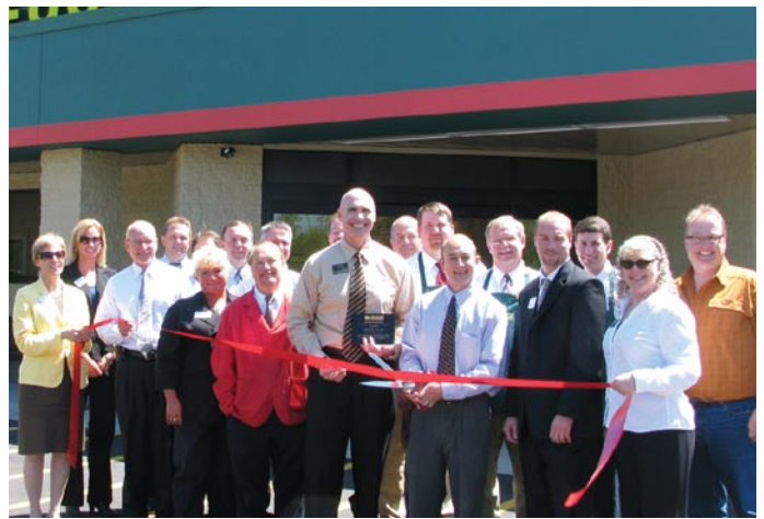
Lakeside Super One Foods grand opening.