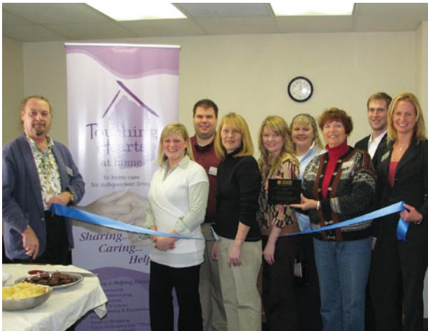
Ribbon-cutting for Touching Hearts at Home's new location – 314 West Superior Street, Suite MZ-75.