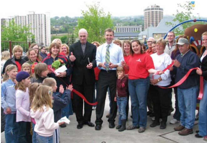
Junior League of Duluth dedicates the new Playfront Park at Bayfront Festival Park.