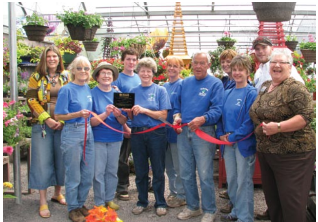
Pederson's Gardens & Landscapes staff celebrated the redesign of their greenhouses, plus their new "Shop By Color" method to buy flowers and plants.