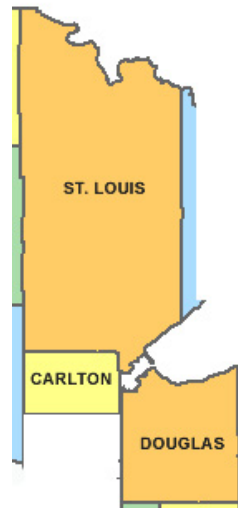
Figure 1. Duluth-Superior, MN-WI Metropolitan Statistical Area (St. Louis, Carlton, and Douglas Counties)

The geographic scope for this economic impact analysis was proposed to be the Duluth-Superior, MN-WI Metropolitan Statistical Area, which is comprised of St. Louis, Carlton, and Douglas Counties.